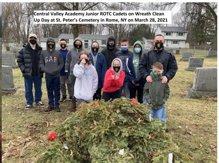
Central Valley Academy Junior ROTC Cadets on Wreath Clean Up Day at St. Peter's Cemetery in Rome, NY on March 28, 2021