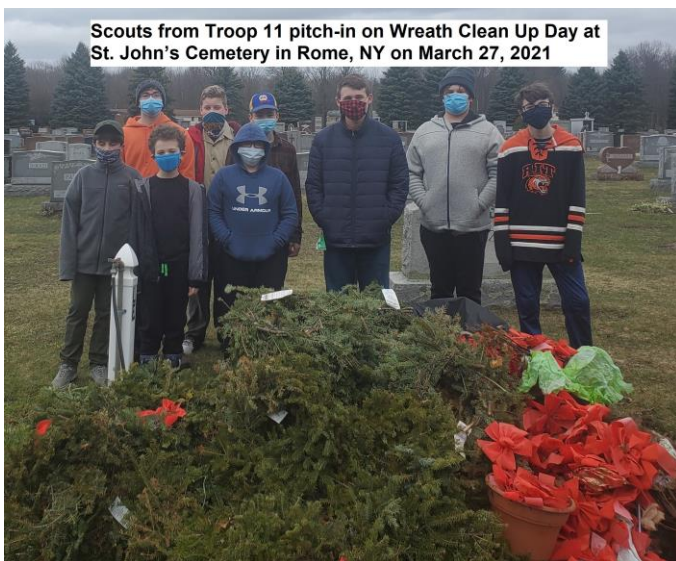
Scouts from Troop 11 pitch-in on Wreath Clean Up Day at St. John's Cemetery in Rome, NY on March 27, 2021