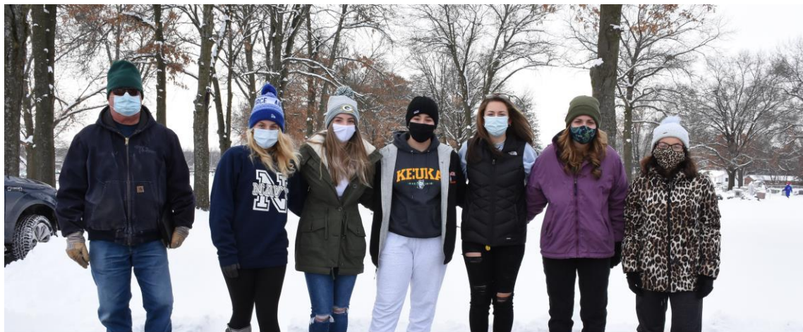
Rome Free Academy Leo Club members and parent volunteers at St. Peter's Cemetery Wreaths Across America ceremonies, December 19, 2020.

Wreaths Across America participation gives us the funds to carry out our mission and excel as a Chapter. To have another successful year we need members to support the program either as a volunteer or by purchasing wreaths as a personal donation. However, we need your help more than your money; so, if you can volunteer in any capacity, please contact me.