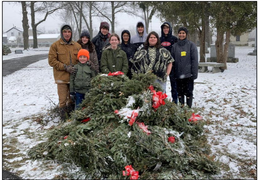
Central Valley Academy cadets help at the Wreath Clean Up Day at St. Peter's Cemetery on March 27, 2022

Community interest and support for the ceremonies at our six area cemeteries continues to grow. Last year we reached another all-time high in wreaths sponsored and funds raised. We widened our appeal for support to include some new corporate donors who responded with very generous wreath sponsorships. Overall in 2021, we had a 35% increase in wreaths placed and funds raised over 2020. We look to do even better this year thanks to some new fundraising ideas and strategies from our Board and chief