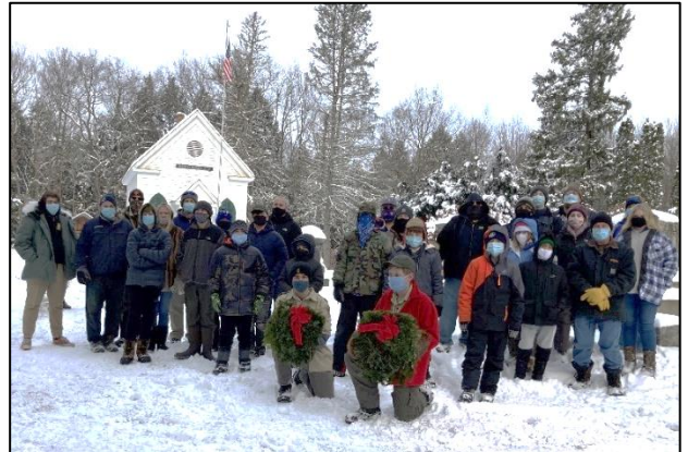
Photos 1: Scouts and leaders from Leatherstocking Council, Powderhorn District, Troops 11, 37, & 175 placed wreaths at 2020 WAA at Wright Settlement Cemetery, Rome, NY